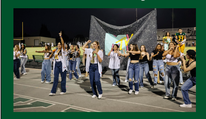
Sophomore Class, 80's; 2nd place