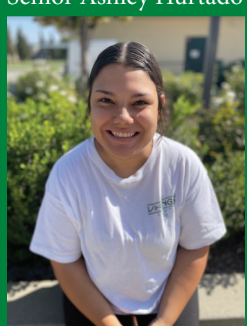
"I think I want to be Lightining McQueen."