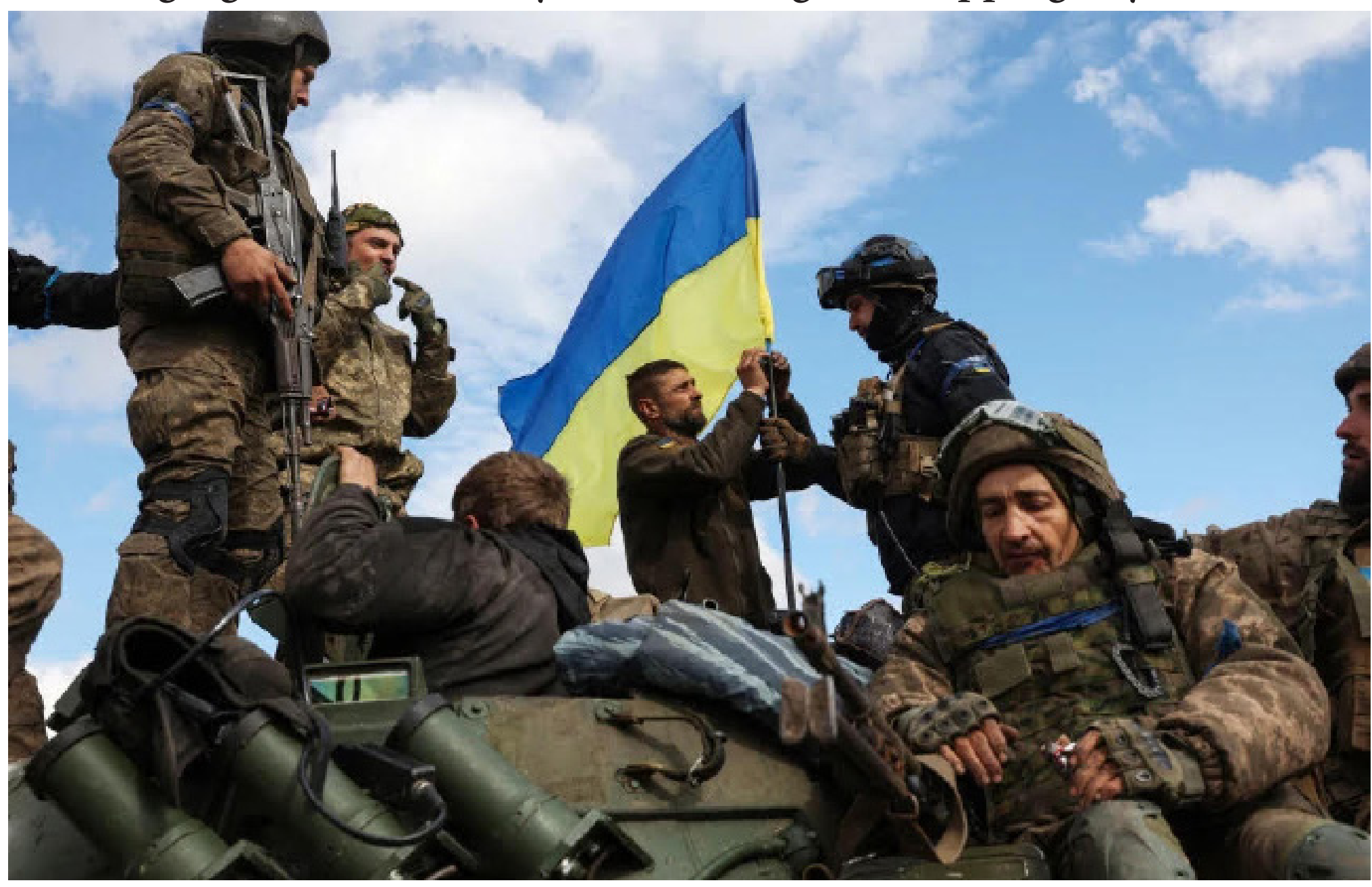
Ukrainian soldiers near Lyman, a key city in the eastern Donetsk region that Russian forces abandoned over the weekend to avoid encirclement.

War waging since Februrary shows no sign of stopping anytime soon.