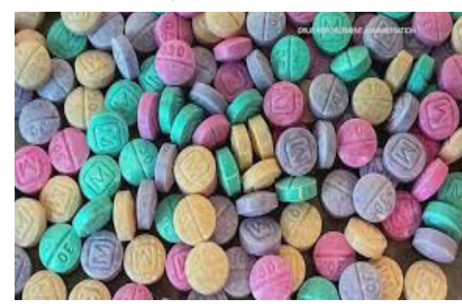
U.S drug enforcment Agency

to ensure that these disguised drugs don't harm people unknowingly.