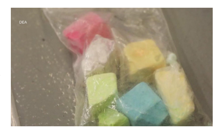
U.S drug enforcment Agency