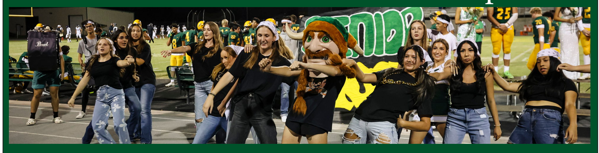
Junior Class; 90's; 3rd place