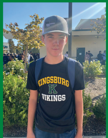
"I'm going to be a banana just because I want to be."